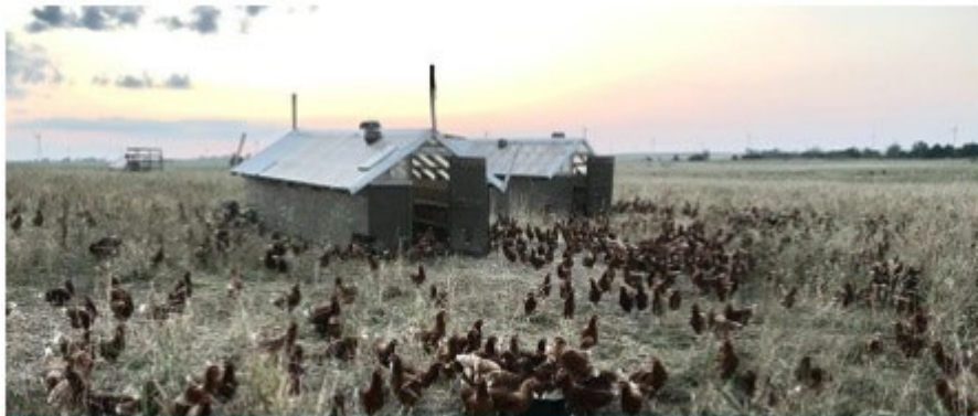
Laying hens at Mint Creek Farm. The Carr family & team were awarded SRP funds to expand egg production and increase the amount of chickens that move through their pastures, which supports soil nutrition and reduces pests while providing additional income.

Soil Restoration Notes have been used to support farmers during their transition period into organic certification. As the offerings progressed, the intentions around the soil restoration pool also evolved. Originally conceived as rent and mortgage relief, the SRP eventually offered direct assistance for projects related to the organic transition. From there, it broadened further to its current version, which includes soil restoration and other on-farm risk mitigation projects beyond the organic transition. Effectively, we expanded our use of the pool funds to support better soil health, conservation, and financial stability for the farmer. This broadening also impacted eligibility and made these funds accessible to farmers taking on the organic transition as well as those who had already completed it.