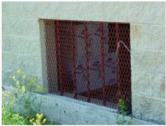
Metal Screen for Window Airflow/Vandals