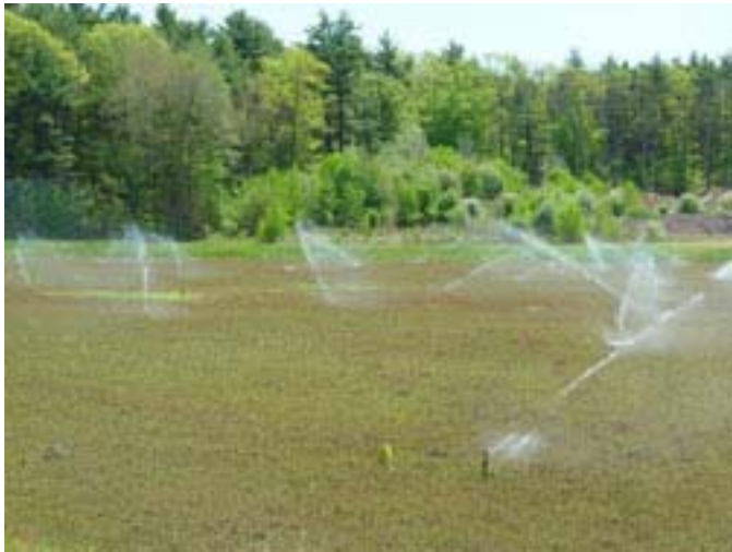
Irrigation of a Cranberry Bog