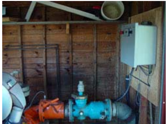
Control Box and Pump