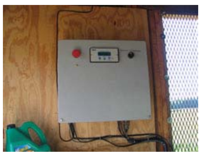
Controller in Pump House