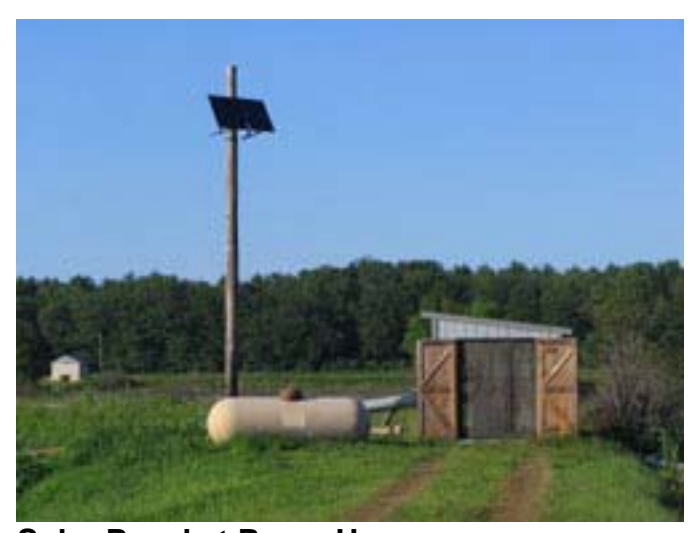
Solar Panel at Pump House