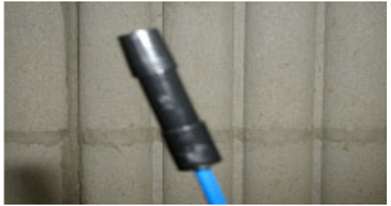
Temperature Probe (thermistor type)