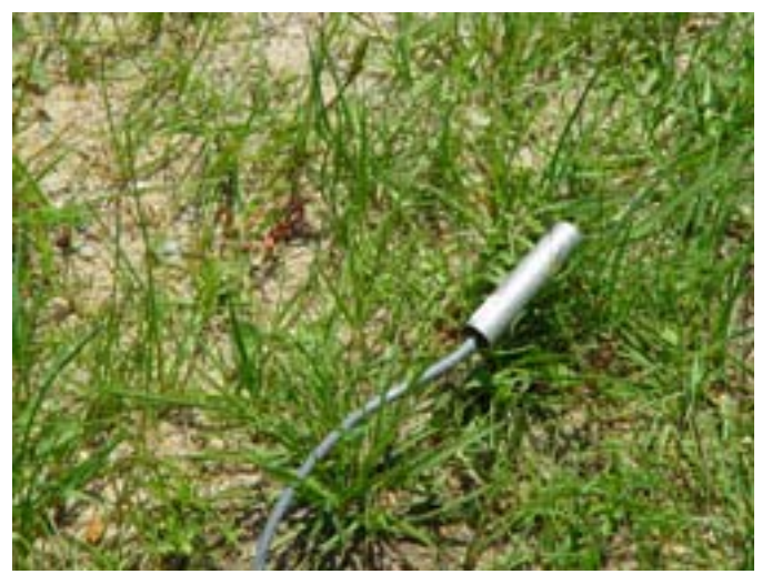
Temperature Probe (thermistor type)