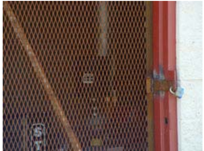
Metal Screen Door for Airflow/Vandals