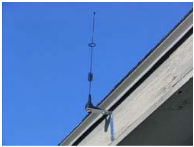
Antenna Mounted on Pump House Roof