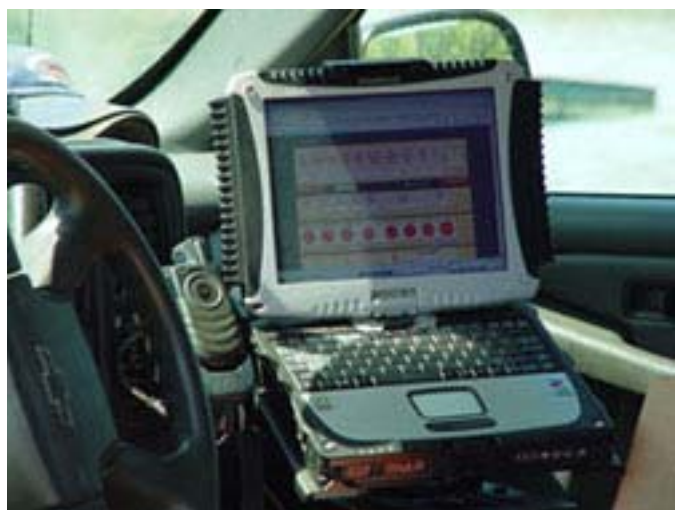
Laptop Connecting to Remote Server