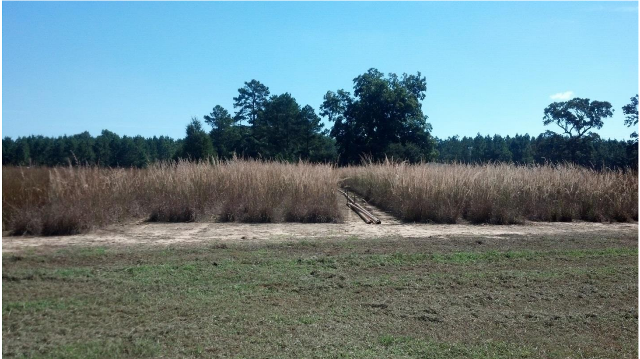
Image 1. K&L Forest Nursery production area in Buena Vista, GA